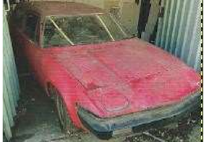
The car was "discovered" in storage

It was owned by a fellow Triumph enthusiast, from whom I'd bought a rare Triumph TR7 Sprint. I saw the Tracer estate when I collected the Sprint and asked if it was for sale. It wasn't, but he promised that he would ring me if he ever decided to part with it. Then, just before Christmas 2021, he did so, when he needed more space to complete the restoration of an early Triumph TR7. I felt as if I had won the lottery!