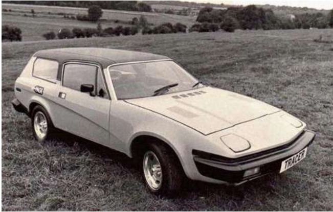
The TR7 Trader

The single wagon conversion, named the Crayford TR7 Tracer, featured a rear hatch and a back seat of sorts, making the TR7 a 2+2. However, the styling apparently didn't light any fires among the British auto-buying public. According to ARAOnline's Declan Berridge, the mod resulted in a "...rather awkward-looking sporting estate...Despite several motor show appearances and appearances in various car magazines and annual guides, it never got off the ground, perhaps a victim of its own unhappy styling."