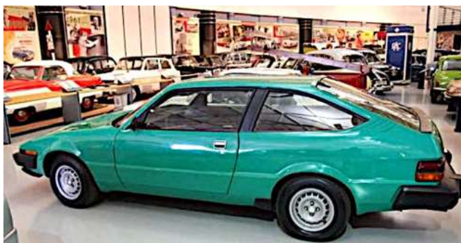
The surviving Lynx prototype

Sources: "One-Off Wagon to Roll Again," Classic & Sports Cars , September 2022; Declan Berridge, "The converters: Crayford Engineering TR7 Tracer," AROnline , 16 February 2019; "Triumph TR7: Triumph and Crayford," Crayford Convertible Club, n.d.; Keith Adams, "The Converters: Crayford Engineering," AROnline , 23 July 2018; Keith Adams, "The specialists: Rapport Forté," AROnline , 6 June 2022;