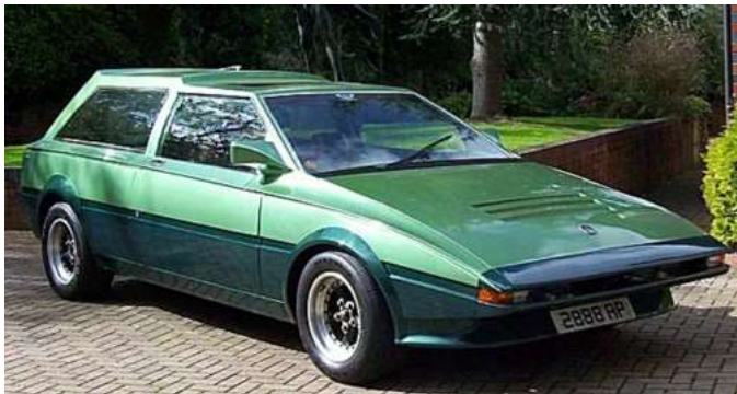
Forté Estate